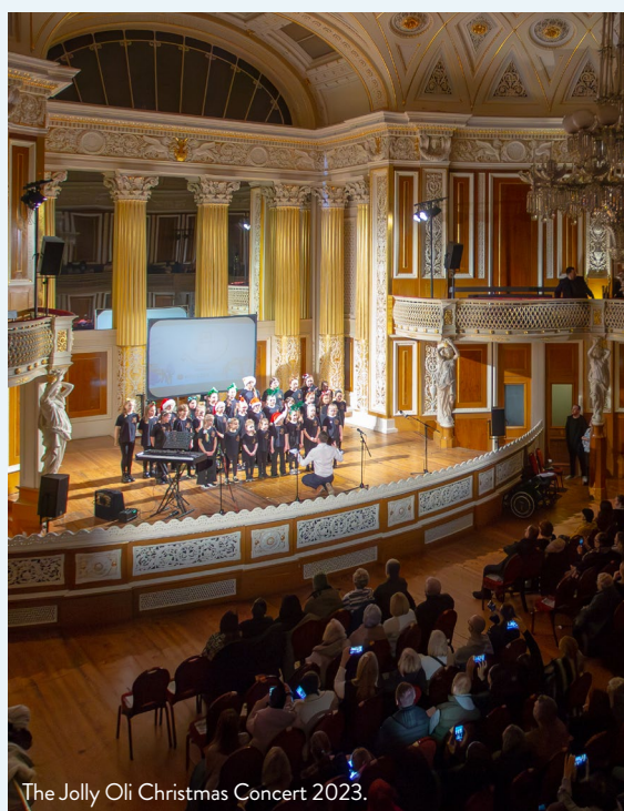
The Jolly Oli Christmas Concert 2023.