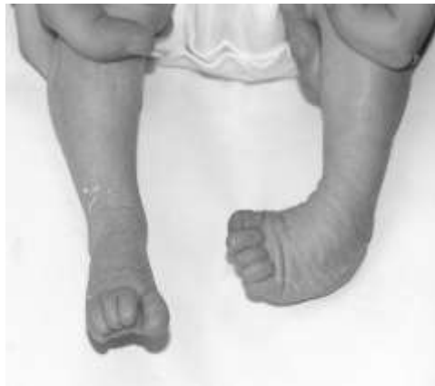
Photograph of a child with Club Foot

Club Foot is an abnormality of the foot. Sometimes the foot and part of the lower leg points downwards and inwards and will not easily return to a normal position. Club Foot occurs in 1 out of 1000 children in the UK and the condition is more common in boys than girls. Both feet are involved in about half of affected children. There is increased risk of having Club Foot if there is a family history of the condition.