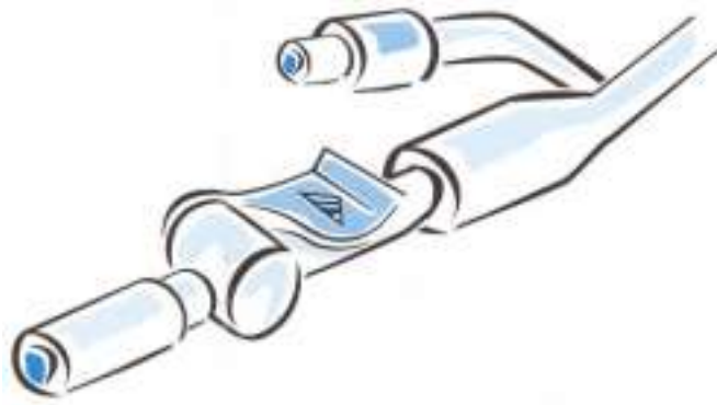
Diagram showing Flip flow valve with Clamp in off position