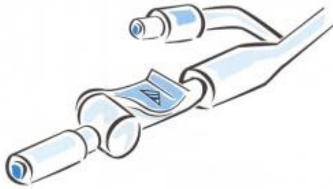
Diagram showing Flip flow valve with Clamp in off position