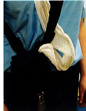
Photograph of a recorder placed in bag

Whilst being monitored, your child will be able to attend school or nursery as normal but will not be able to take part in sports or swimming class whilst the electrodes are in place.