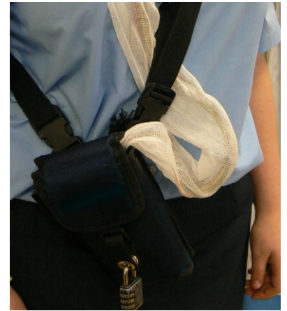
Photograph of a recorder placed in bag

Whilst being monitored, your child will be able to attend school or nursery as normal but will not be able to take part in sports or swimming class whilst the electrodes are in place. They will not be able to wash & comb their hair or have a bath/shower.